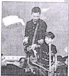
Video grab from the event

Gujarat folk singers is not a new aspect, but the showering of gold and silver coins as well as money at the event on Thursday has not only captured people's imagination but sent videos viral on social media.